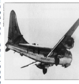
Below: A Tupolev Tu-95 in flight.