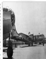
Below: A Tupolev Tu-16 in flight.

The design bureau's history is closely tied to the development of the Tupolev Tu-16, a twin-engine jet bomber. The bureau's work on this aircraft led to the development of the Tu-95, a strategic bomber, and the Tu-144, a supersonic transport aircraft. The bureau's success in these areas is a testament to its design capabilities and its ability to work with the Soviet government to develop advanced aircraft.